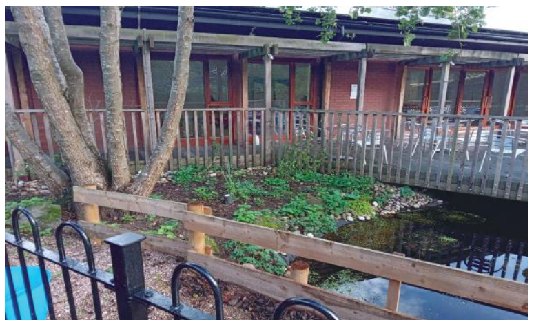
The new pond with wildlife enhancing plants