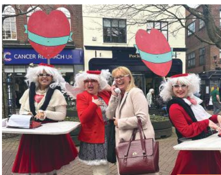
Business Festival street entertainment